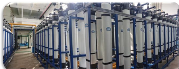
Pretreatment for Seawater desalination and water reuse